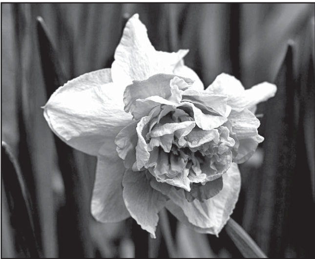
Bunch of daffodils.

AA – Recovery Meetings will be held on Tuesdays, 7pm at Spruce Grove Church, 44 Spruce