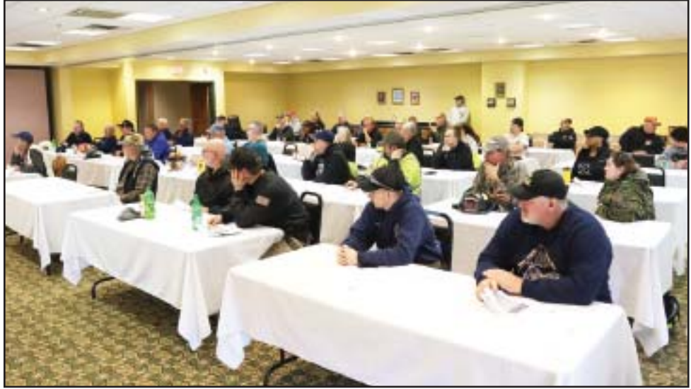
Nearly forty Braxton first responders attended the specialized training.