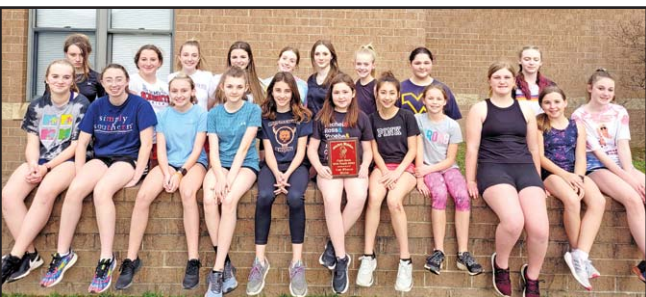
BCMS Lady Knights.

The Knights have no meets until April 5.