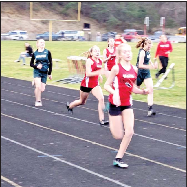
BCMS Lady Knights had four first place finishes at Walton.