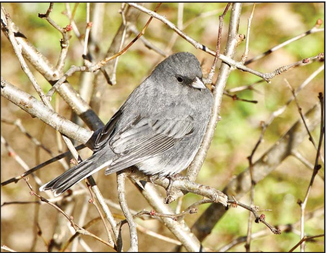
Junco predicting snow.

Apparently, there are about 150 different species of mycorrhizae (Identified till now) around the world and in different types of