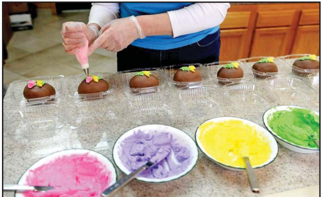
Each egg is decorated with a colorful flower on top. supporting our library through this fundraising understanding and er.

It is that time of year! Peanut Butter Egg season! You can place your order with a Friends of the library member or directly with the library by calling (304) 765-7224. They are $6 each. This fundraiser by the Friends of the Library is one of the biggest fundraisers to help cover the library utilities and salaries of our staff. Volunteers work tirelessly for many weeks to prepare these eggs. For many years, the Friends of the Library have absorbed the rising cost of supplies but this year they made the hard decision to raise the price by $1 to help cover the additional costs not only for the fundraiser but to help rising costs for the li-