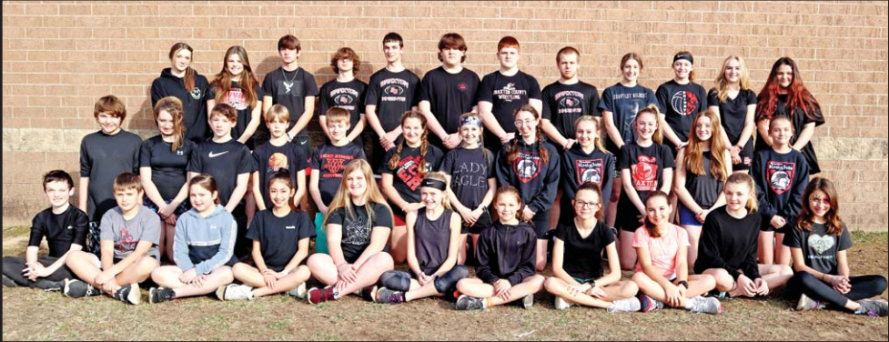
BCMS Knights prepare for the Spring season.