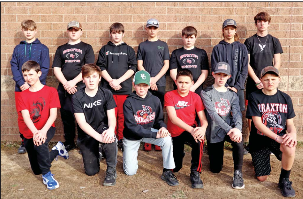
BCMS Knights are ready to load the bases Monday night on the Braxton Field.