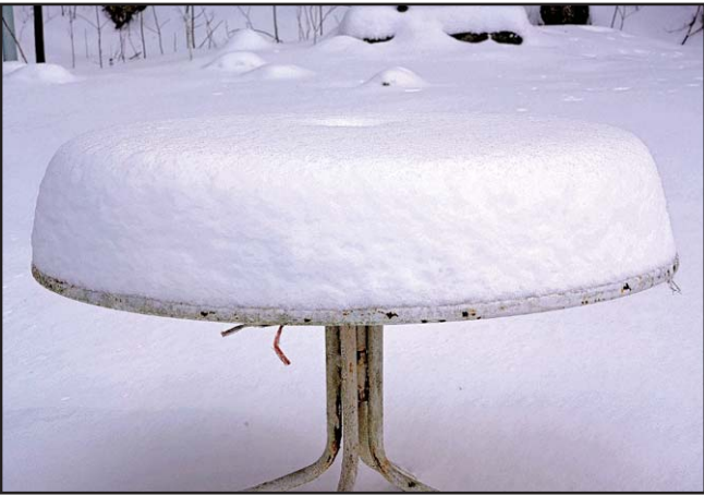
A picnic on snowy table?