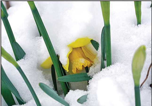
Daffodils protected by snow.