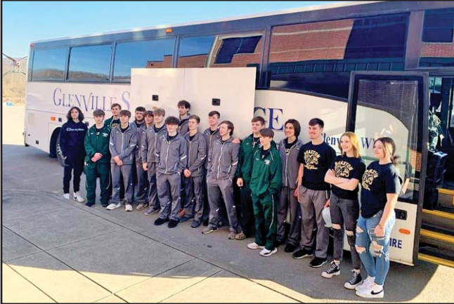
Good luck to the BCHS Eagles Basketball team.

I probably should not have mentioned the juncos at the beginning, because 24 hours later we woke up to 8” of the good old, fluffy white stuff and this morning to a temperature of 4 degrees. Take that on the day when daylight savings starts. Be glad you were not in my company this morning!