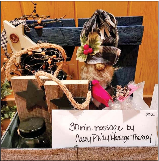
One of the baskets available to win at the BCSC Bingo on Saturday, March 19th

Due to inclement weather, the Braxton County Soccer Club Bingo at the Sutton Moose Club has been rescheduled for March 19, 2022 at noon. Ticket packets of twenty bingo games will be sold at the door for $20.00 per packet. Prizes will include: Coach, Dooney and Bourke, Fossil, and Born handbags. Craft Baskets, Sports Baskets, Oil Changes and detailing certificates, Massage and beauty gift certificates and more! Food and refreshments will be available for purchase. Come out and play bingo, eat some food and support the BCSC.