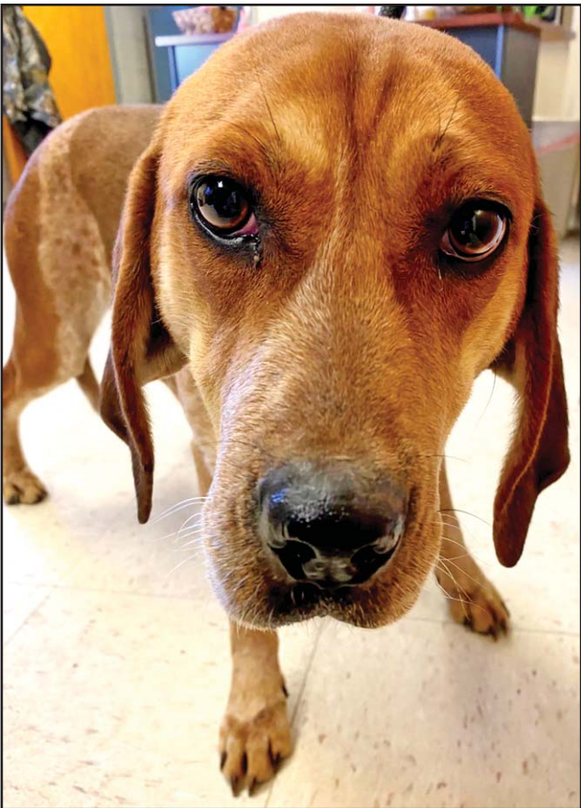
Your can donations help pups such as Dahlia currently awaiting thier new homes at the BCAS