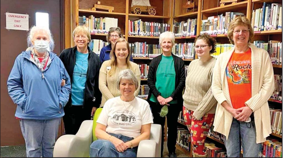
Friends of the SPL gear up for their annual peanut butter egg sale.

Braxton County Animal Shelter has been given the opportunity to provide five free dog spay surgery vouchers per month, to low-income Braxton County families. These vouchers may be obtained by completing a Spay Assistance Application, which can be picked up and submitted at the animal shelter during business hours. Vouchers will be good for 30 days. BCAS reserves the right to deny financial assistance for any reason. These free spay surgeries must be scheduled by the voucher recipient at Central WV Animal Hospital. This program has been fully sponsored by our rescue partner Awesome Paws Rescue of Buffalo, NY. This rescue has been an amazing asset to Braxton County for nearly five years, by pulling hundreds of dogs from our county and finding them amazing new forever homes. Thank you from the bottom of our hearts to the folks at Awesome Paws! Spaying female dogs is important because: It helps to reduce pet overpopulation, It can reduce aggression issues, It can reduce the chances of roaming dogs, It can lower the risk of cancer, It can increase lifespan three to five years.