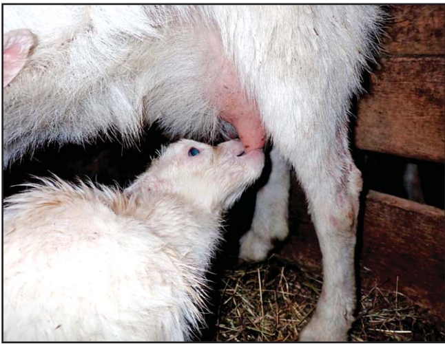
First meal, a half an hour after birth.

interviewer asked her in what way, she explained that with her unvaccinated status she was denied unrestricted access to restaurants, events and social gatherings that demanded visitors to be vaccinated. She had her freedom taken away from her. She thought that Jews had been denied the same rights that were denied to her. That was the Holocaust, thanks, to our great educational system.