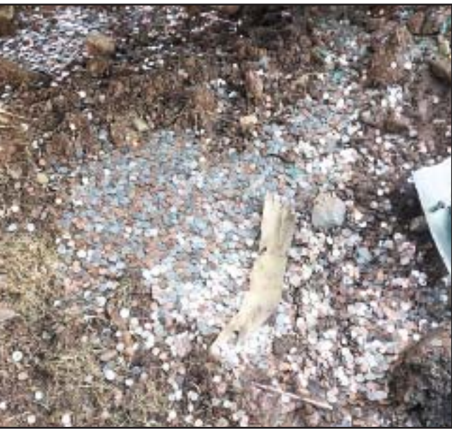
A large portion of the $50,000 to $75,000 cargo was scattered around the crash scene of a Loomis truck.