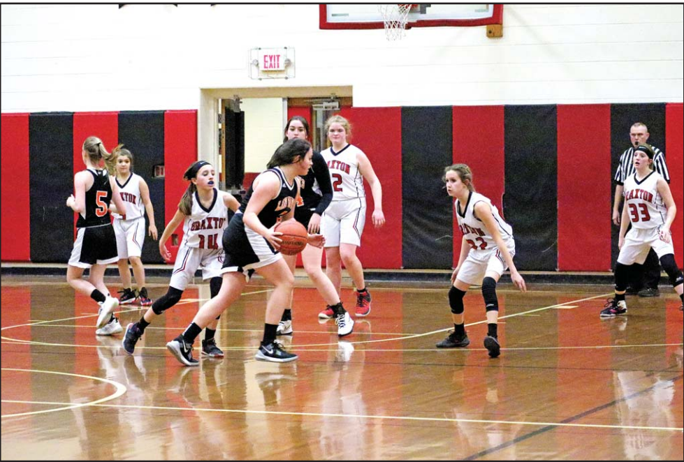
The Lady Knights defense works hard to keep their opponents from scoring.