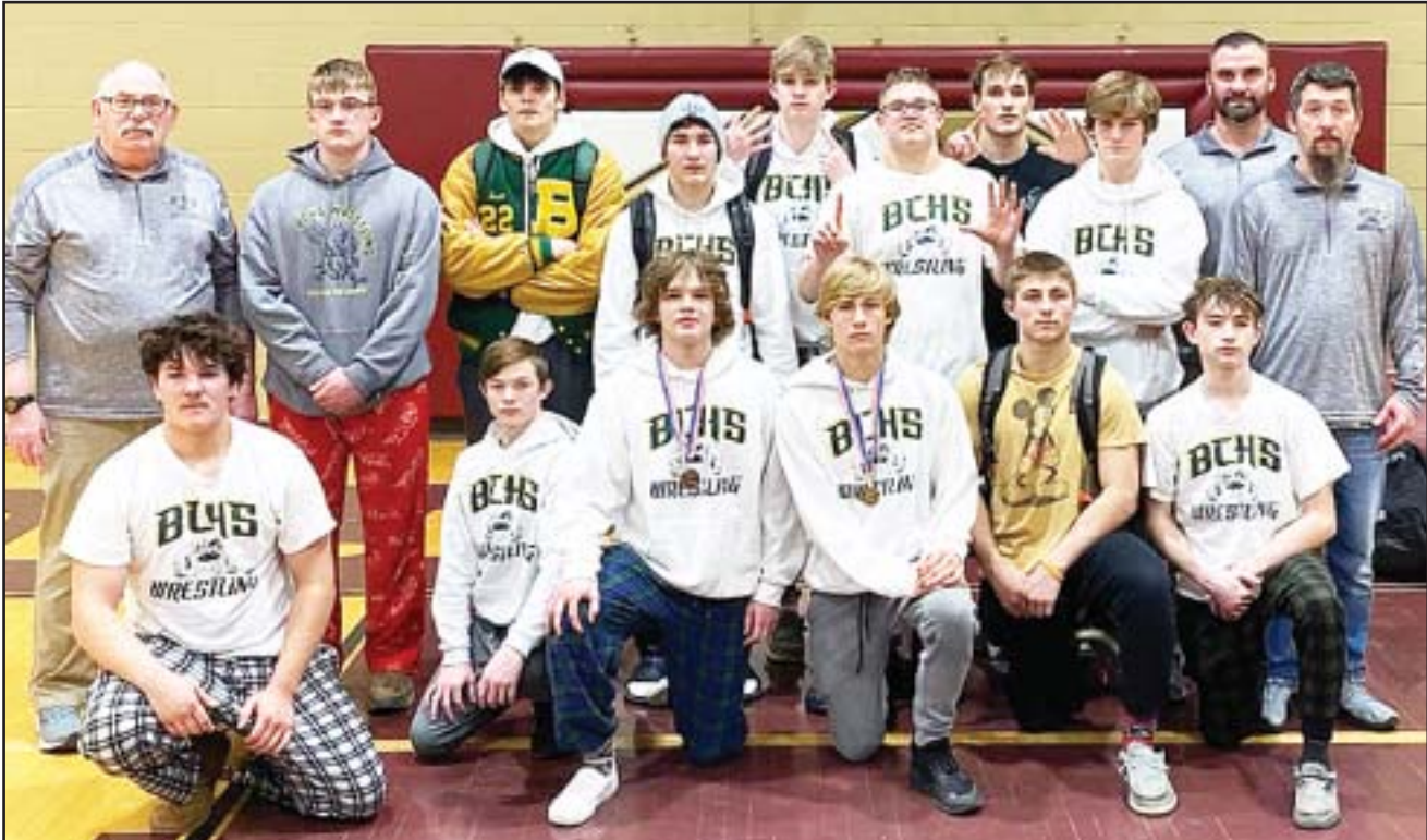
The Braxton County High School Wrestling Team captured their 6th straight Little Kanawha Conference Championship last Saturday at the LKC Tournament in Williamstown with 14 teams vying for the title.