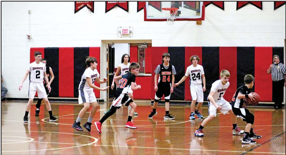
The Knights defense leave no room for Richwood to score.