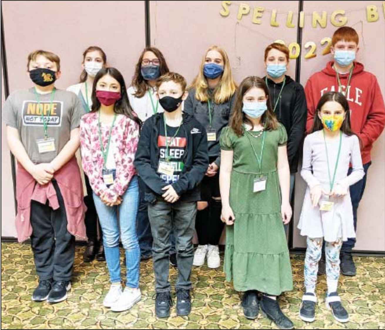
Students who competed in the 2022 Braxton County Spelling Bell held last week at Day Inn and Suites.