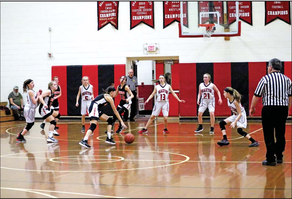
The Lady Knights defense work together to keep Richwood from scoring.