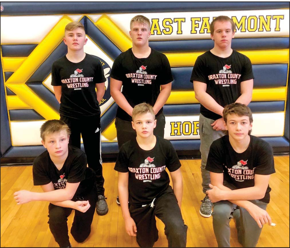
Braxton County Middle School Wrestlers