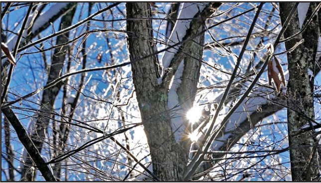
Sun behind tree.