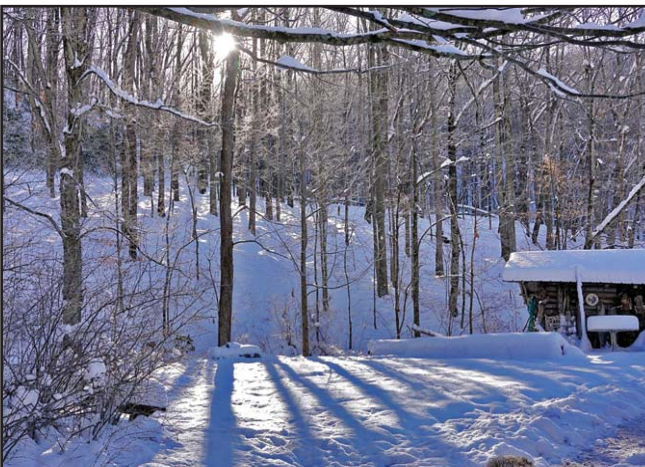
Sun over the hill.