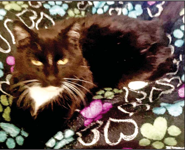
DJ is ready to warm your lap this Valentines Day, give him a chance to steal your heart.