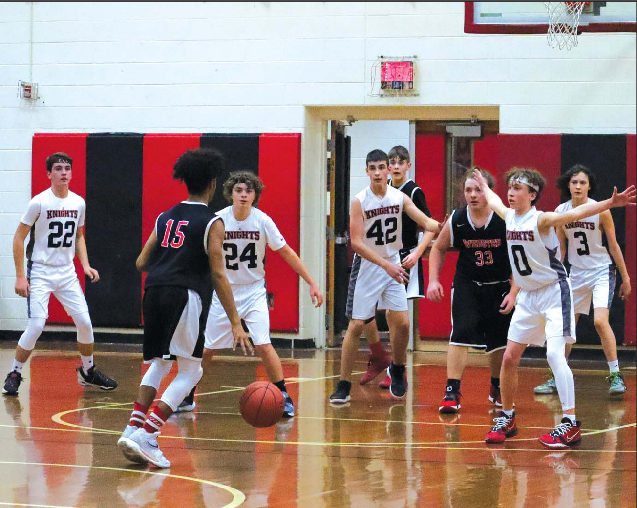
The Knights defense lining up as a Webster player brings in the ball.