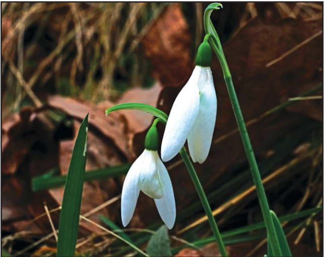
Snowdrop, very early blooming, Dec. 26th

Call (304)765-5193 if you need additional information!