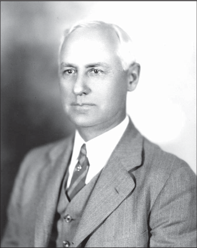
Jan. 8, 1866: William Gustavus Conley was born near Kingwood in Preston County. Conley was the 18th governor of West Virginia, serving from 1929 to 1933.