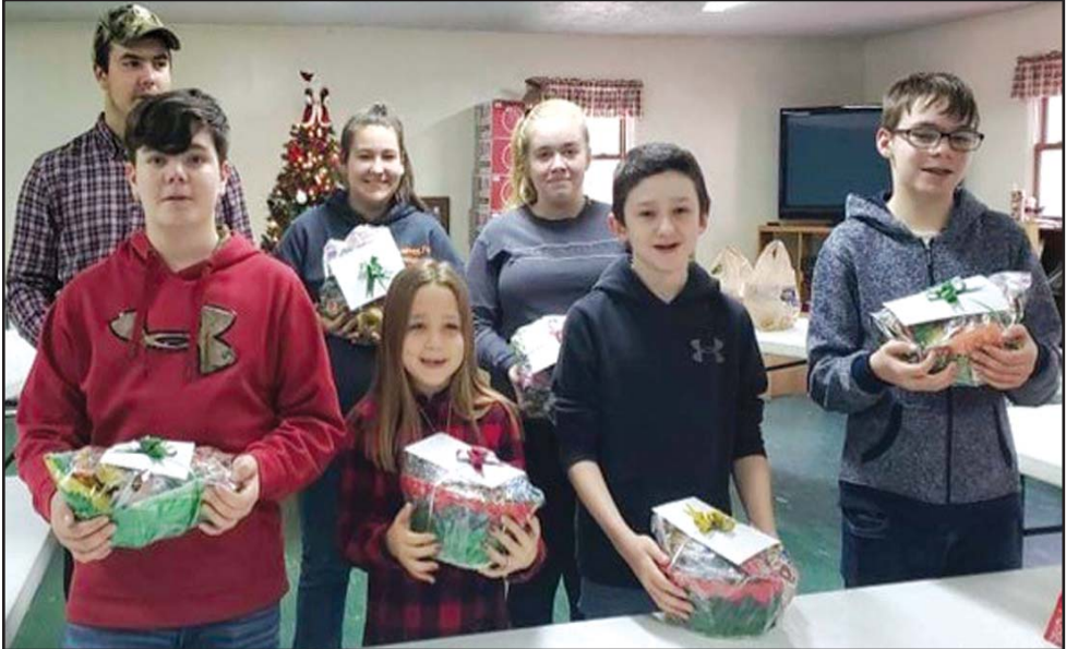
Members of the Frametown Trailblazers 4-H Club show off the fruit baskets ready to be delivered to local residents.