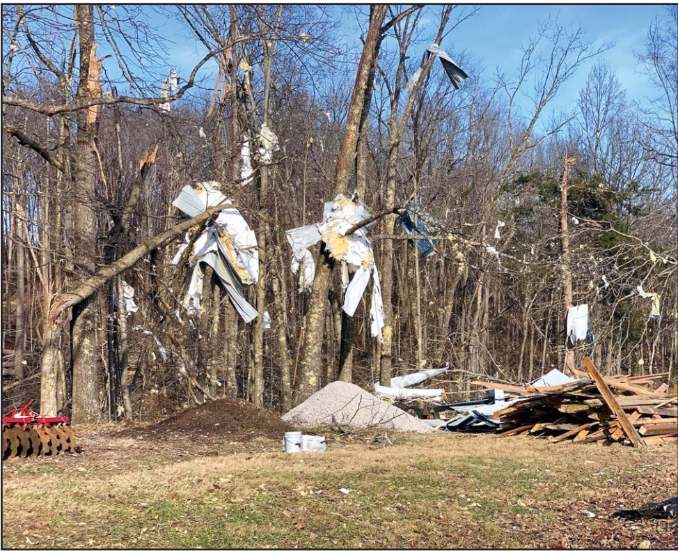
Trees were full of debris from the tornadoes.

While in the Bluegrass State, the team helped homeowners clean up storm related debris in