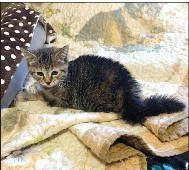
JEWEL: 8-9 week old female brown tabby, short-haired