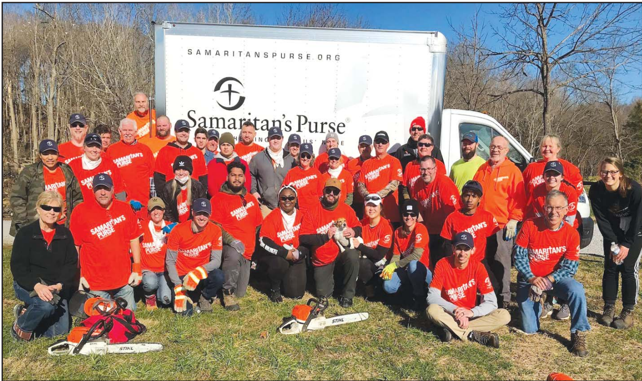
Gassaway Baptist Church members served alongside Samaritan's Purse to assist with relief efforts.