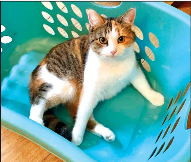
SUGAR: Momma cat, young adult, calico short-haired, fully vetted, including spay and rabies vaccine.