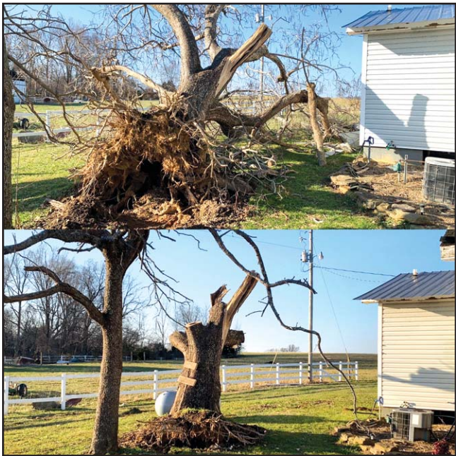
Tornadoes rip thru Kentucky.

by the storms: Mayfield, Bowling Green and Dawson Springs.