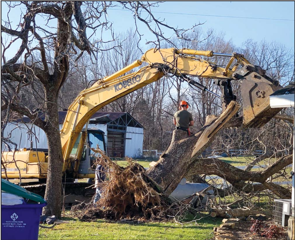
Heavy equipment was brought in to help with the destruction.