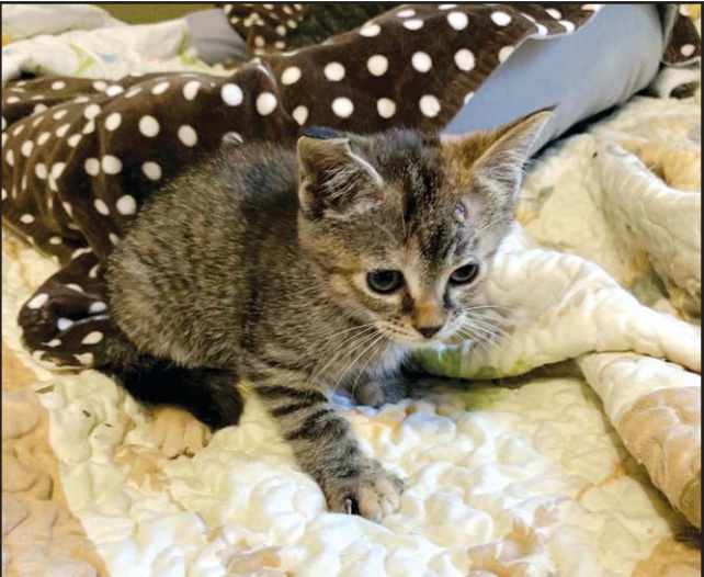
SHIMMER: 8-9 weeks old female brown tabby, short-haired