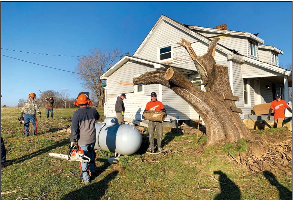
Members of Gassaway Baptist Church help Samaritan's Purse after all of the devastation.