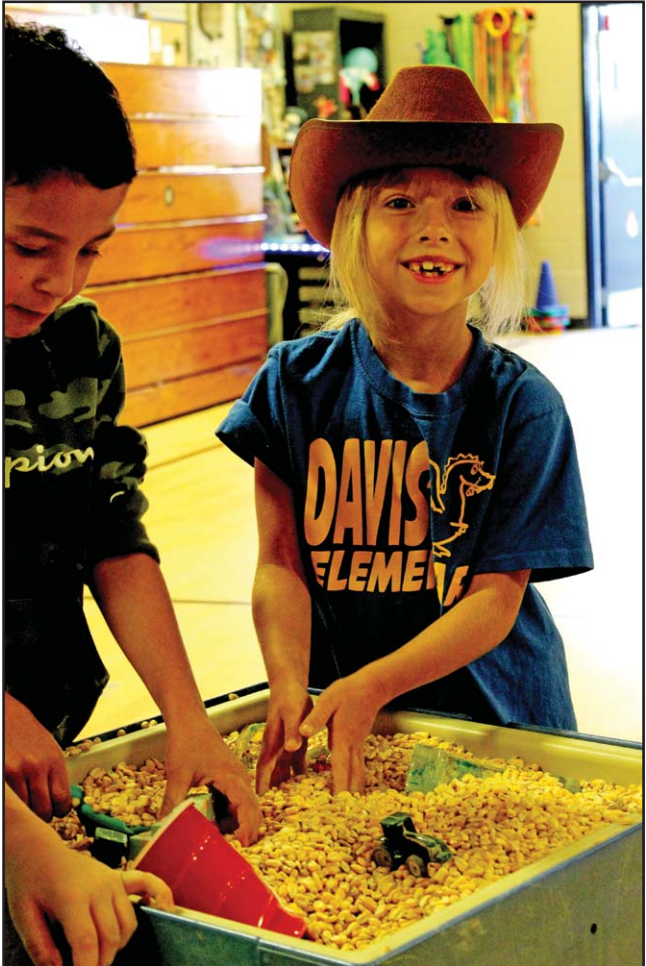
Students experienced how to press apples, played in sensory corn bins and learned how to square dance at the event.