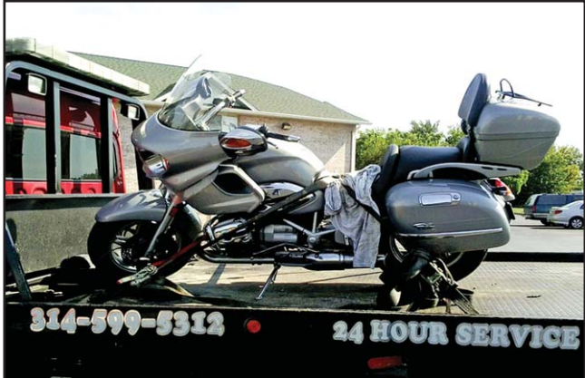
2004 R1200CLC in tow, ready for the dealer.

Heights, I feel the back of the loaded bike fishtailing. Thinking I got a flat, I slowed the heck down and hobbled over to the hotel, a couple of hundred feet off the exit. After parking at the hotel, a quick view reveals a back tire full of gear oil. The CLC is a shaft-driven bike, so, the differential had gone wacko. Not so bad. I didn’t crash, especially since I was doing over 80 on the highway, and the hotel was close to the exit. So, I checked in, ate, and it’s Sunday, so nothing moves. I found Gateway BMW, a mere 13 miles away in St. Louis, MO, and guess what? Also closed on Monday! Spent Monday watching TV, talking to the hotel staff, and booking a tow truck for Tuesday morning.