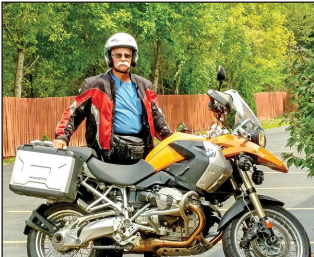
The really cool R1200GS they lent me to go back to my hotel.

So is the tale of the miracle motorcycle. I traded the 2012 many miles later in Sarasota, FL. for a 2016 K 1600GTL, the bike on which I rode to Alaska, and this bike and I wrecked and survived coming back to Sutton from a mechanic in Athens, OH. The insurance company was nice enough to buy me a new 2018 K1600GTL, the bike I still own. Blessed? Yes!