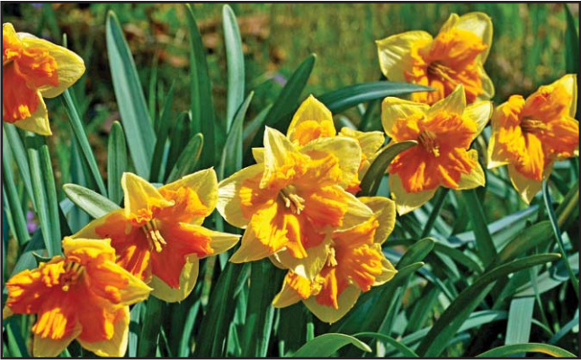
One type of Daffodil.