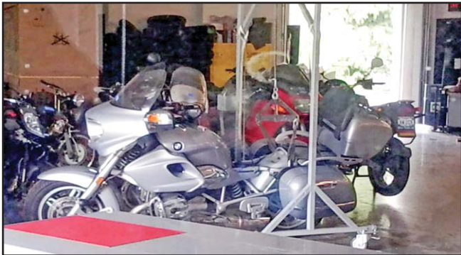
CLC waiting in the loading area at Gateway BMW. You can see some of the new bike crates I inquired about on the top left.

Sunday, August 14, 2011, a clear, sunny, beautiful West-by-God Virginia morning, I leave Sutton on one of my long-ass trips which will make a loop from WV to South Dakota, Colorado, Arizona, Florida, and many points in between before looping back to Sutton. Perfect riding weather: eight-hour-plus trip to a Best Western in Fairview Heights, IL, to continue Monday to Missouri to visit some friends from Miami. Getting off I64 exit 12 for Fairview