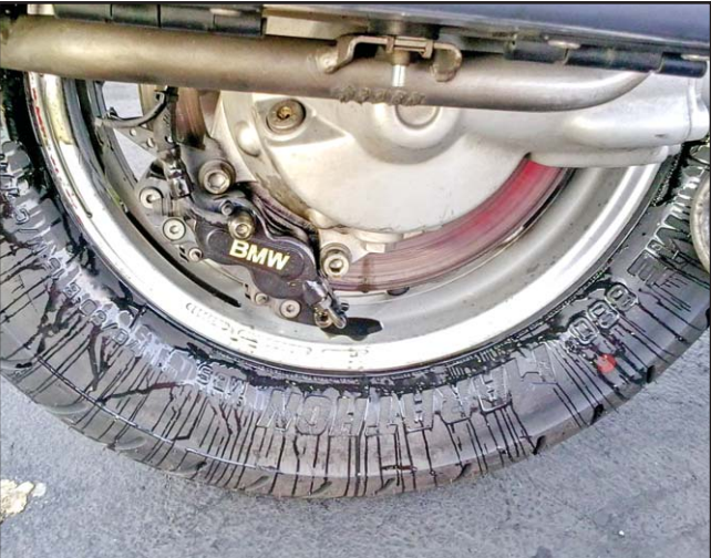
Differential oil everywhere!

When I moved to Sutton in 2007, I brought my 1988 HD Heritage Classic Softail. Loved that bike. I lived in Miami previous to moving here, so I rode the bike nearly every day. Took it to my first trip to Sturgis in 2000. Did the Iron Butt SaddleSore 1000 in 2001.