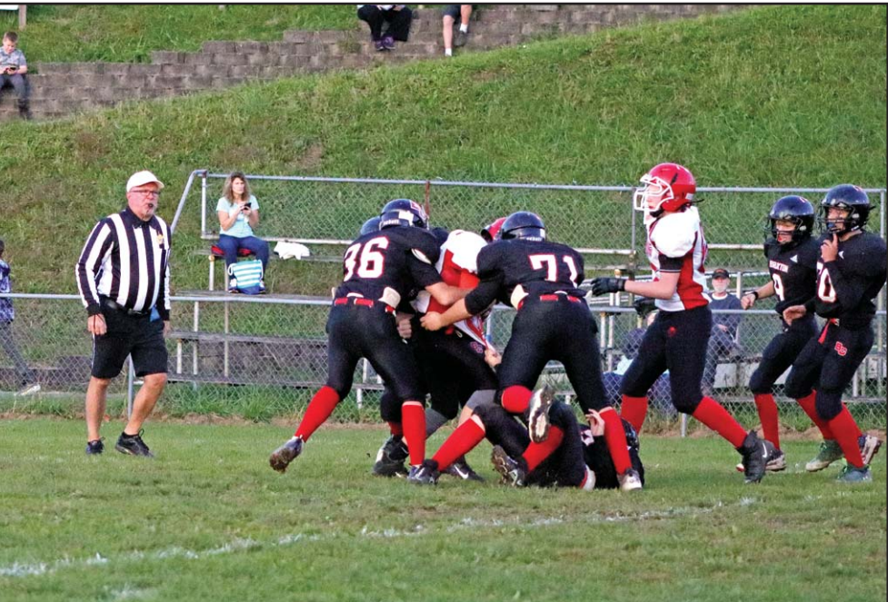
Knights defense sacking the Demons quarterback.