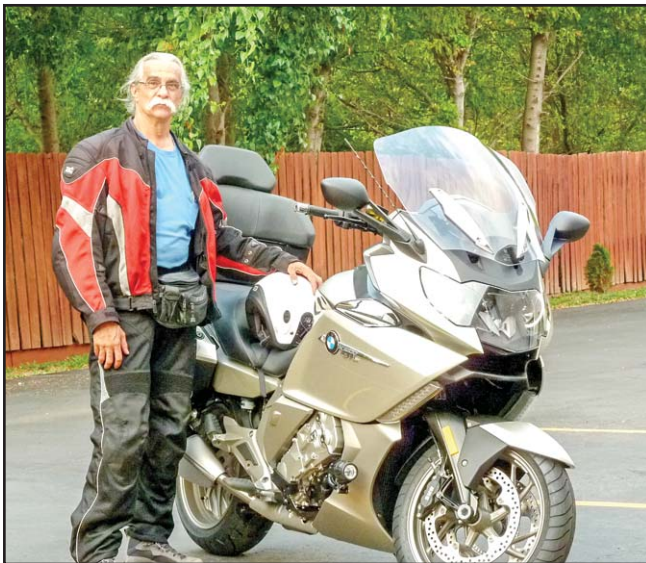
Really bad helmet hair, but a very happy owner of a 2012 K1600 GTL. Continued the trip the next morning. Stopped to visit friends in Gunnison, CO, and Tempe, AZ.