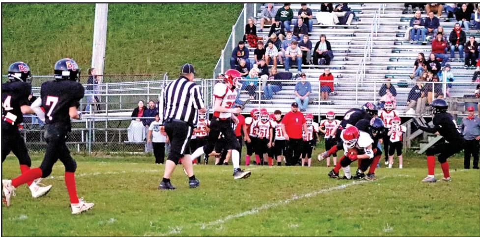
The Knights take down a runner.