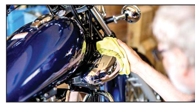
Wash, wax, and polish your motorcycle before stor-

7- Lastly, insurance on your motorcycle, an overlooked, and often misguided subject, is worth looking into. Storing your bike for the winter doesn't stop the thieves from stealing it or something damagto ride during unseasonably warm days during winter. It is recommended that you do not cancel the insurance during the winter months, but rather, find a way to lower the premi- most, increase the deduct-