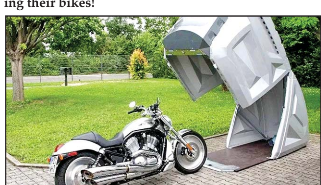
Instant garage, if you can afford this.

ums without sacrificing the coverage. According to the Insurance Information Institute (III), you may be able to purchase what's called a "lay-up" policy, which temporarily suspends all but the comprehensive coverage on your motorcycle insurance. Comprehensive coverage protects you against an event that's not related to a collision, such ing the bike, whether you as theft, vandalism or other store indoors or outdoors. similar incident that might Theft, fire, vandalism, and occur while the bike is in on a calendar helps me storm damage are poten- storage. Remember, if you tial hazards. More likely to decide to ride the motorhappen is the opportunity cycle having this coverage and you wreck, you will be responsible for all the costs incurred due to the accident. My suggestion is that you leave your insurance the way it is, or, at