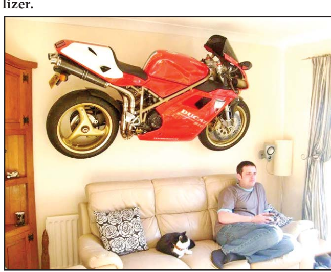
Some Dudes get creative and passionate about storing their bikes!