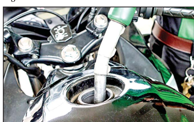
made of synthetic mate- Fill up the gas tank completely and add fuel stabi-