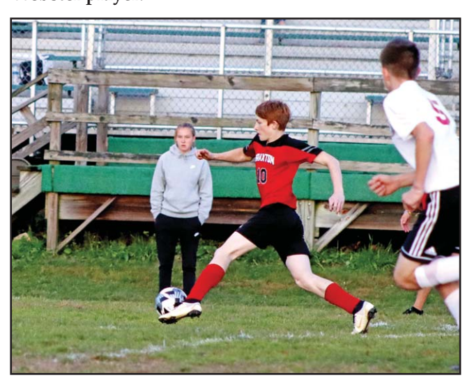
way to the Knights first goal.