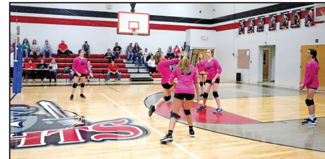
The Lady Knights work together to gain their next point.

and Courtney Browning who were able to count 28 spikes between five girls in one game." She added, "Needless to say, I'm super proud of our girls and