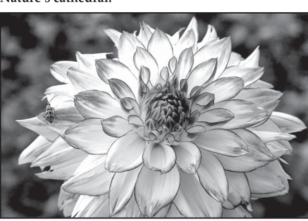
Next year's dream.

them selenium. We purchased a gel that contains both, selenium and vit E. We advise people not to offer goats or sheep a block of minerals, they just can't get enough from this hard substance if they are in dire need of salt and minerals. Choose a loose mineral for goats ( will contain more copper) and make