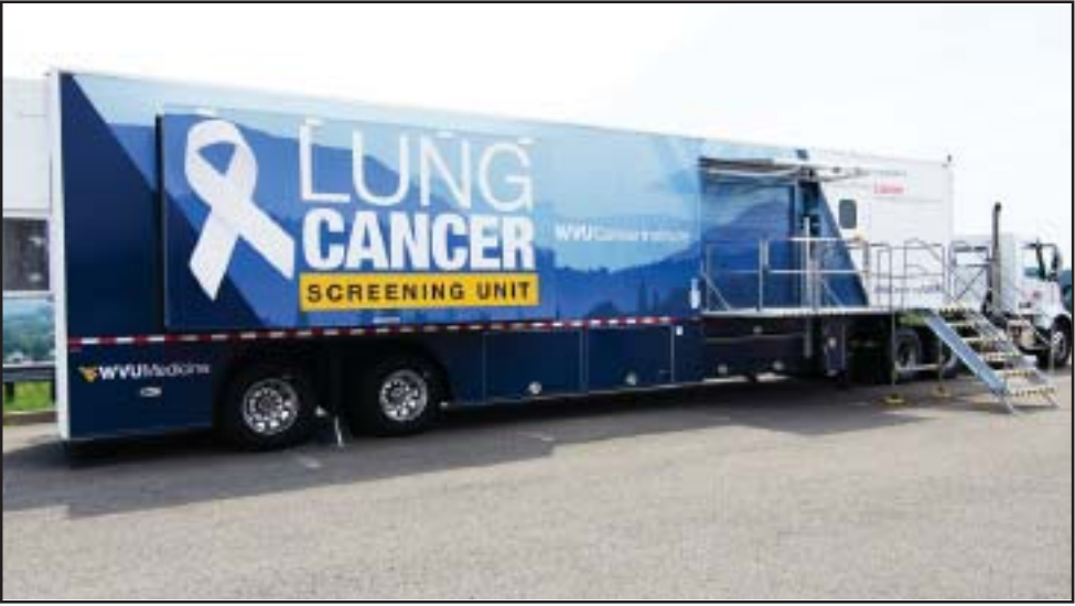
LUCAS, WVU Medicine's mobile lung screening unit travels to 42 West Virginia Counties to low-cost state of the art computer technology.