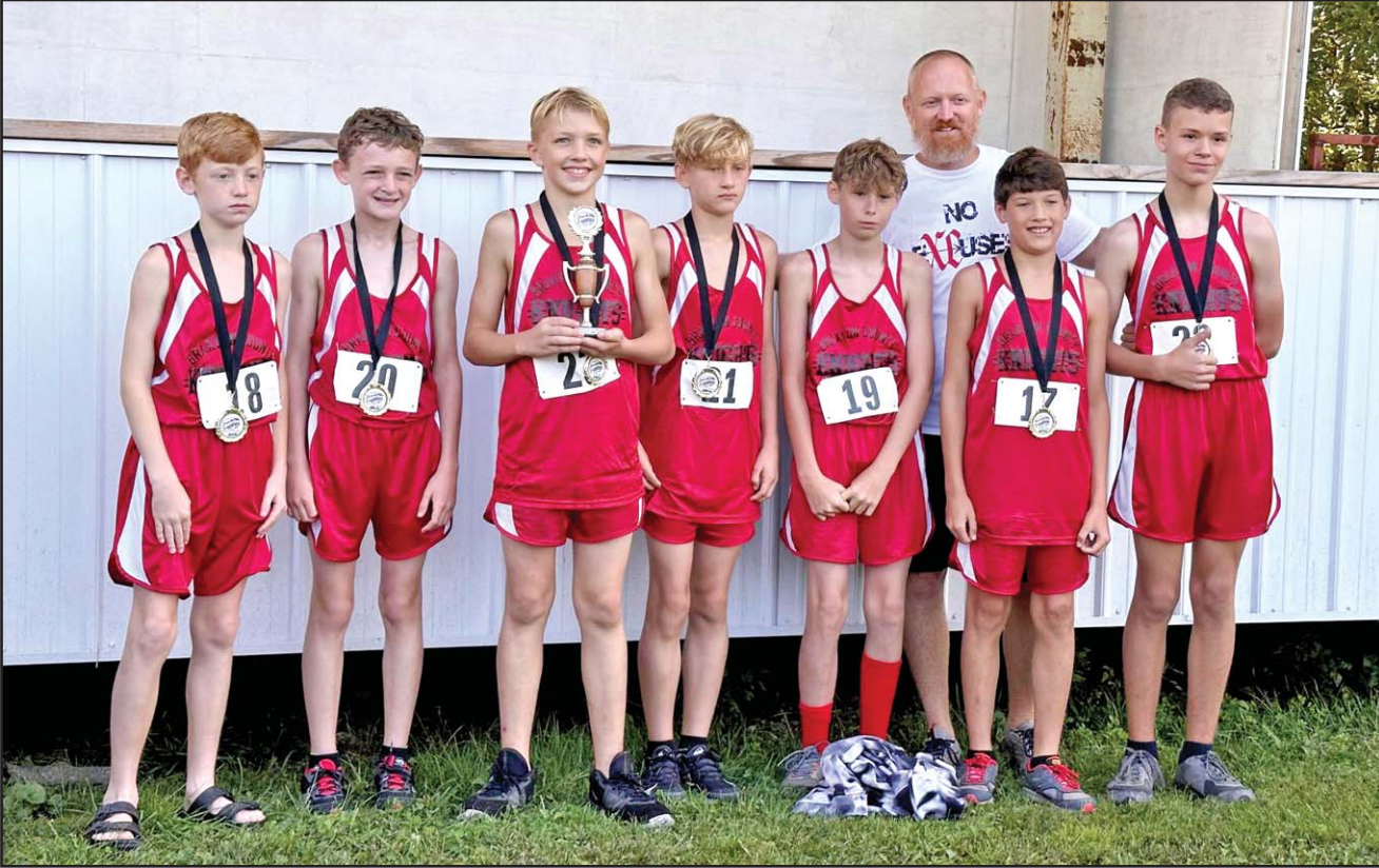
Braxton County Middle School Knights