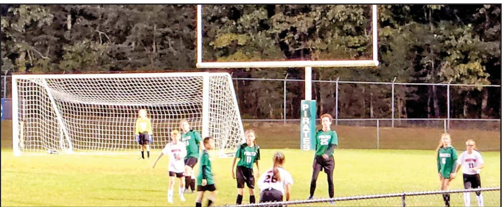
Braxton County Middle School Knights Junior Varsity team plays against Fayetteville.