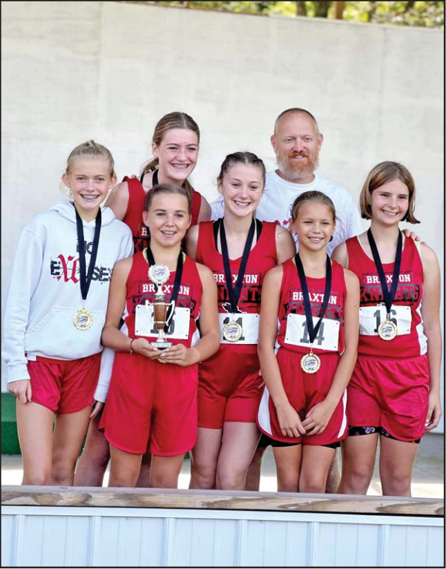
Braxton County Middle School Lady Knights