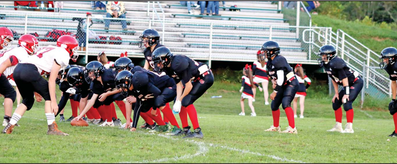
Braxton County Middle School Knights Offense.