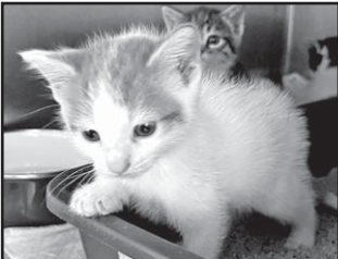
Simba: male, orange body with orange spots

Just One Generation cat rescue was started in 2013 in response to the severe feline overpopula-tion in this area. Our ini-tial emphasis was on the Trap, Neuter, and Release (TNR) of feral cats as well as to facilitate the spay/neuter of domestic cats.