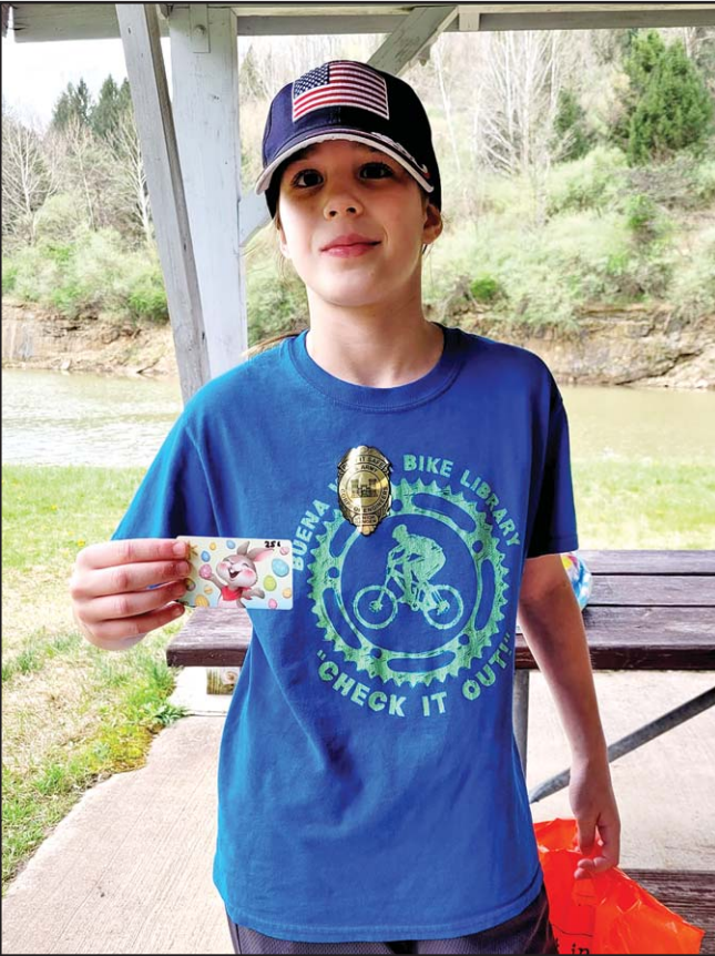
Easter Baskets and $25 gift cards were given to winners in each age group for finding the Golden Egg.