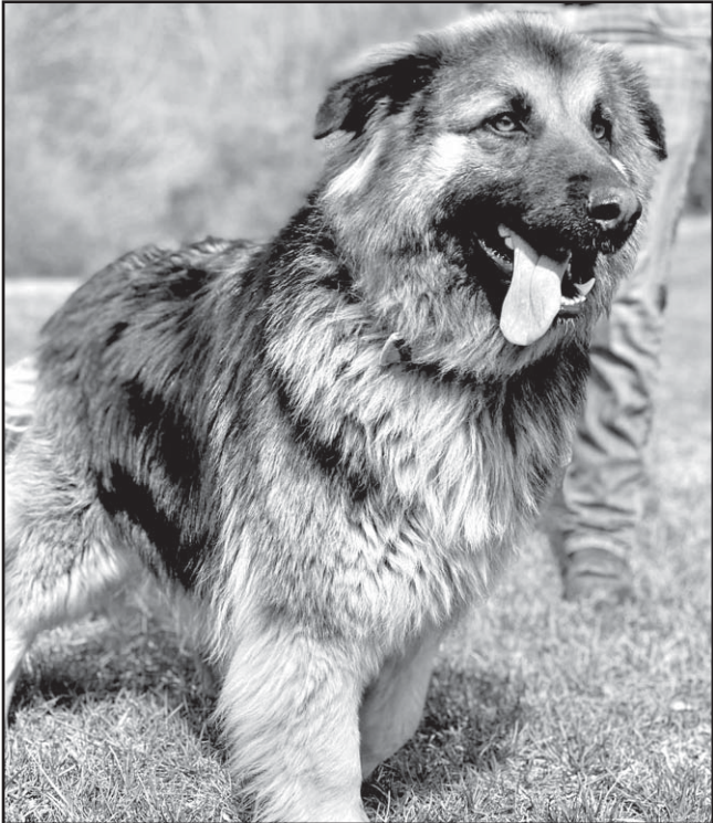
Bella, three year old long hair German Shepard.

Precious: Found pregnant and abandoned last January. Mother to 6 kittens born at a Just One Generation foster home on 2/22/22. Kittens now placed. Momma is spayed, immunized and looking for someone to care for her in the same excellent way she cared for her babies.