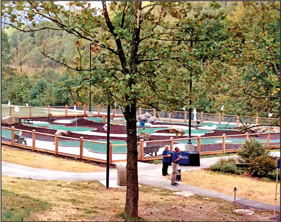
The official grand opening of the Community Miniature Golf Course is Thursday, April 28th.